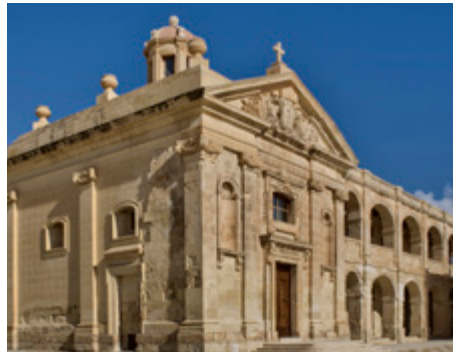
Restoration of the Chapel of St. Anthony of Padua