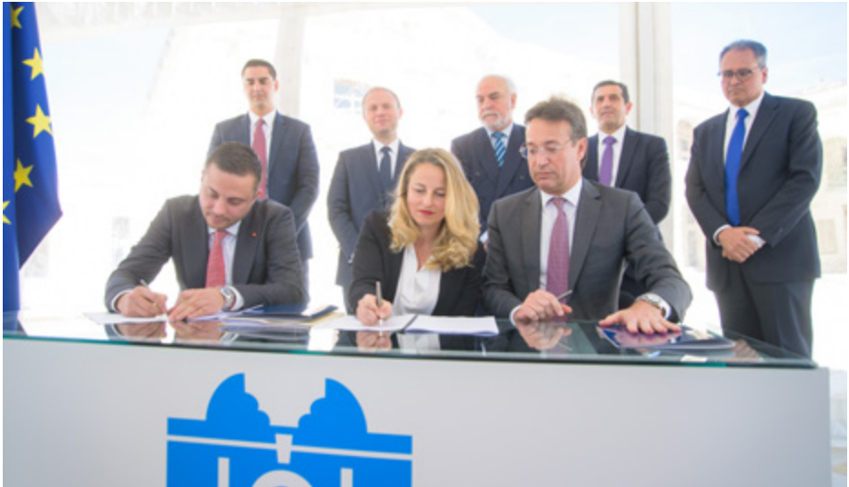
Signing of Guardianship Agreement