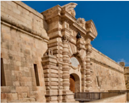
Restored Couvre Port