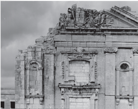
The Chapel of St. Anthony of Padua pre-restoration