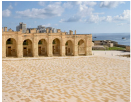
Restored Piazza, Fort Manoel